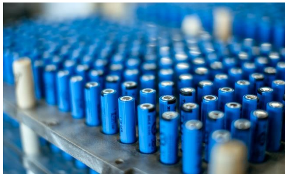
Ni-MH rechargeable batteries