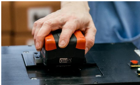
Li-ion rechargeable batteries